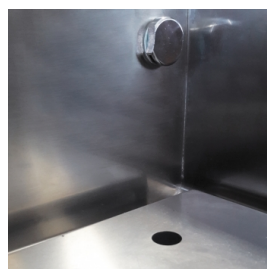
Integrated water tap in the tank