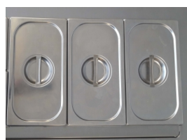
Different combinations of GN basins Examples: M40: 1xGN 1/1 o 3xGN1/3 M80: 3xGN1/3 + 1xGN 1/1