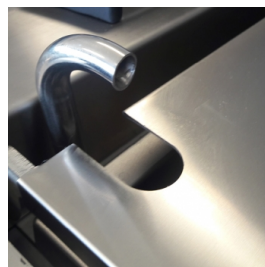
Manual water filling