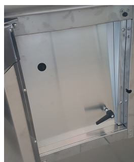
Internal compartment not accessible for total safety in use, closed with a door for aesthetic alignment.