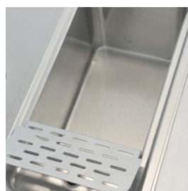
Safety pressure switch prevents heating if there is no water in the basin.