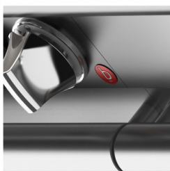
The front bar is a comfortable place for the chef to lean on; it means you will remain at a safe distance from the worktop and therefore protects from accidentally knocking against both items lying on the worktop and the knobs.