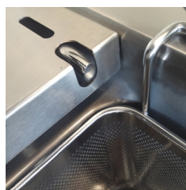
Safety pressure switch to prevent the activation of heating without water in tank.